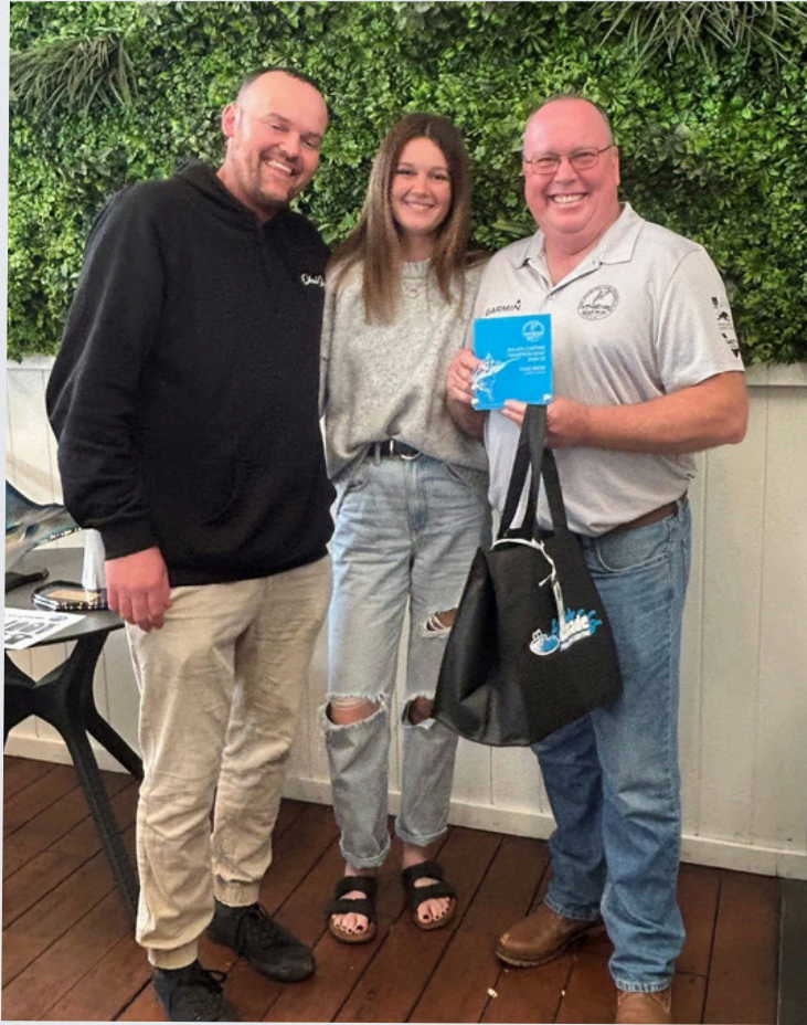
Champion Capture Boat RARE BREED