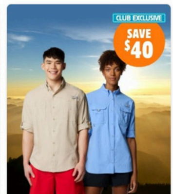
Columbia Men's & Women's PFG Long Sleeve Shirts REG $109.99, CLUB $69.99