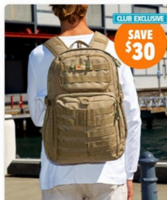
Caribee Combat Day Pack 32L REG $129, CLUB $99