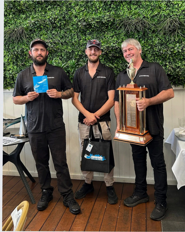
Champion Tag and Release Boat UWISHN