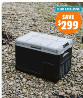
Dune 4WD Frontier 50L Single Zone Fridge/Freezer REG $599, CLUB $300