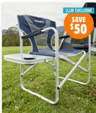
Dune 4WD Directors Chair With Side Table REG $109.99, CLUB $59.99